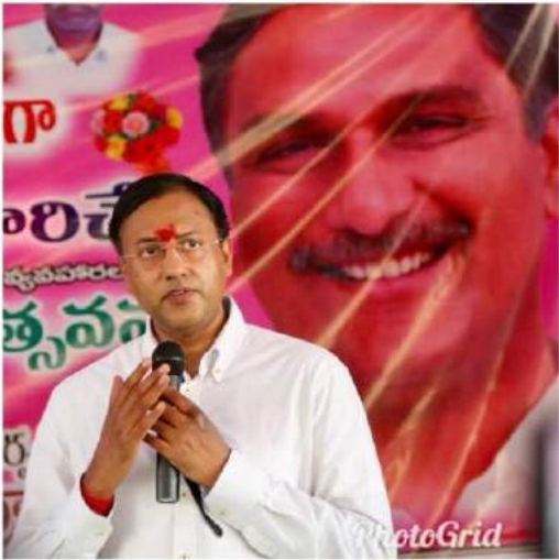
Inauguration of cattle shed in the village outskirts, a first of its kind initiative in the state of Telangana by Mr Harish Rao, Honourable Cabinet Minister in Ibrahimpur (2018) Top right – Dr. Pillarisetti and The Minister with one of the cattle shed beneficiaries