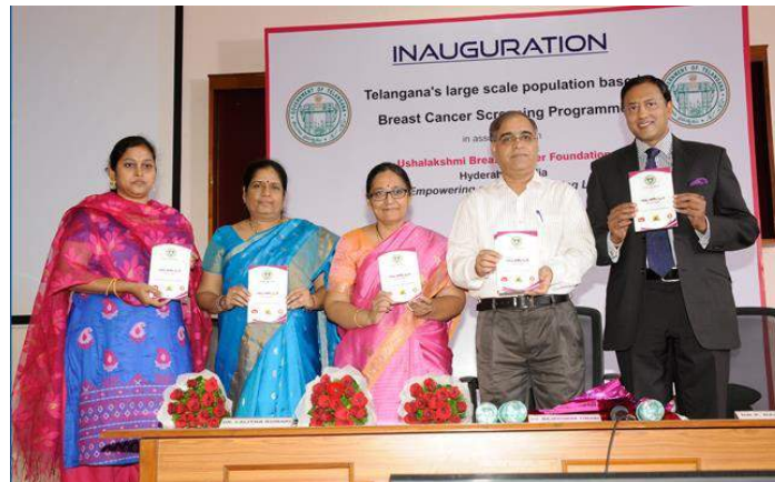
Launch of the screening programme in Telangana by the Health Secretary, Government of Telangana (2012)

https://www.youtube.com/watch?v=tHlamm6SHz8&feature=youtu.be