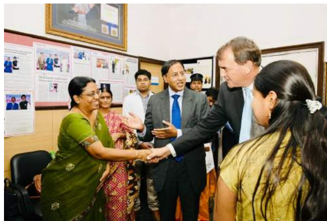
Sir Dominic Asquith, British High Commissioner to India interacting with patients @ KIMS–USHALAKSHMI Centre for Breast Diseases (201)