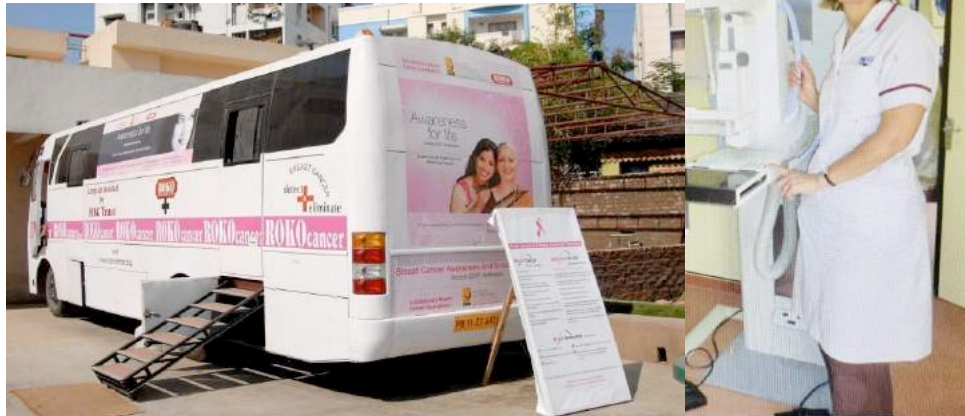
Mobile Breast Screening Unit. Radiographer from Jarvis Screening Unit, UK 950 free screening mammograms over a three month period (October – December 2007)

“Early detection of breast cancer” has been his focus from day 1. Well before relocating to India, he had convinced the KIMS Hospitals Management to invest in “early detection”. In 2007, KIMS Hospitals acquired South India’s first & India’s second full field digital mammography system . At that time, Digital Mammography Unit, priced at USD 260, 000 (ten times more expensive than conventional mammography system), was considered to be a revolutionary advance. The principal advantages being its ability to detect very early subtle changes in the breast particularly in younger women with dense breasts with much greater accuracy in addition to significantly less discomfort & minimal radiation when compared to conventional mammography system. As majority of breast cancers in India are diagnosed between 40 – 60 years, the Digital mammography Unit at KIMS-USHALAKSHMI Centre for Breast Diseases was not only the “talk of the town”, but soon became the ‘talk of the Country’. Several Hospitals & Diagnostic Centres across India, that were initially skeptical about this technology, soon embraced it wholeheartedly.