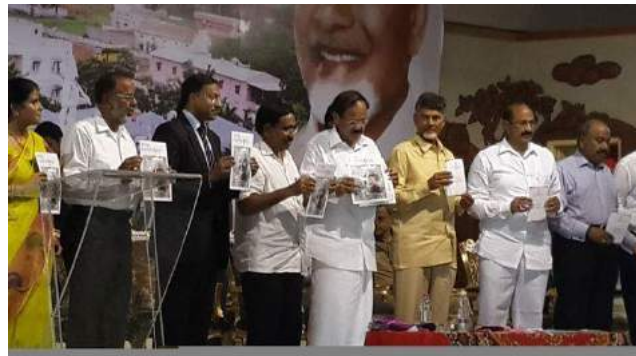
Launch of the screening programme in Andhra Pradesh by the Chief Minister, Government of Andhra Pradesh (2012)