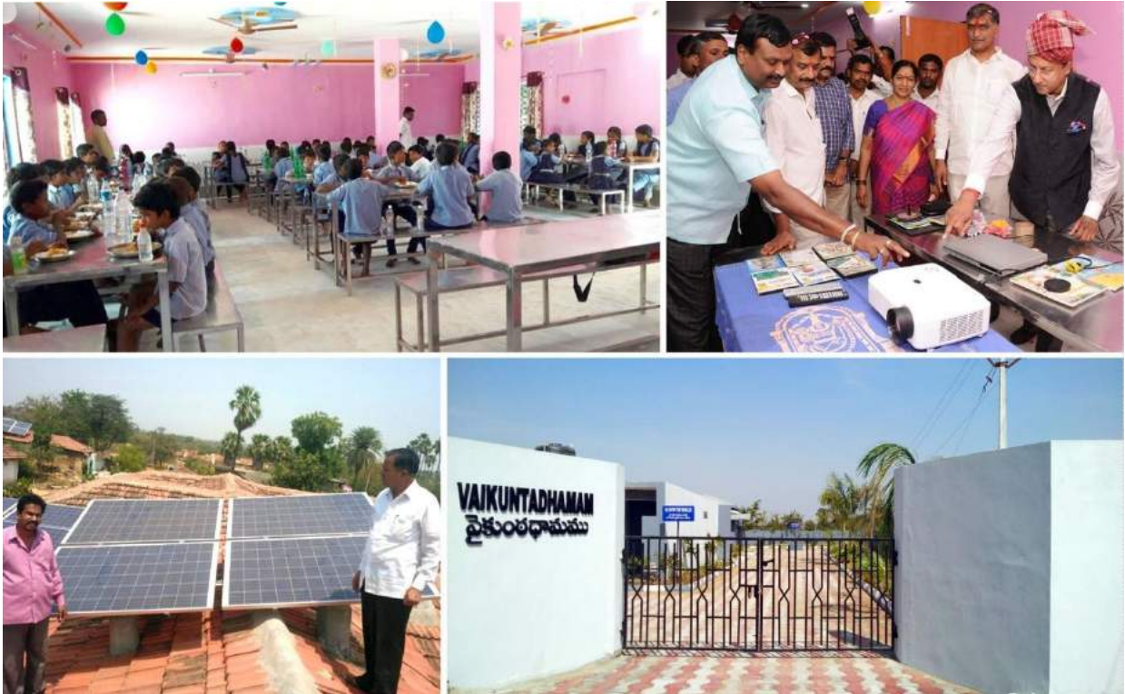
. Dining room and internet access for the school, solar panels, new crematorium in Ibrahimpur