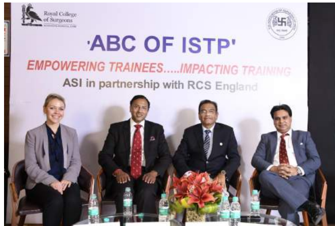
A joint initiative of ASI with RCS England - Empowering surgical trainees from all over India at this Session held in Hyderabad (Jan. 2018).

Out of some 250 trainees who have applied thus far, 55 trainees from all over India have been selected for obtaining advanced training at various NHS centres of excellence in the following specialties – Breast Surgery, ENT Surgery, General Surgery, Neurosurgery, Plastic Surgery, Trauma/Orthopaedics, Urology and Vascular surgery.