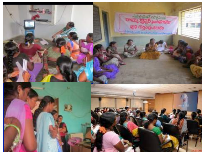
Training & empowering women being educated in the Village Community Centre

This milestone project made national impact in 2016 and a high-powered Steering Committee and Technical Advisory Group (TAG) set up by the Government of India's Union Ministry of Health, of which he was a member, approved the proposal to implement CBE based Breast cancer Screening Programme all over India. This initiative is currently being rolled out nationwide.