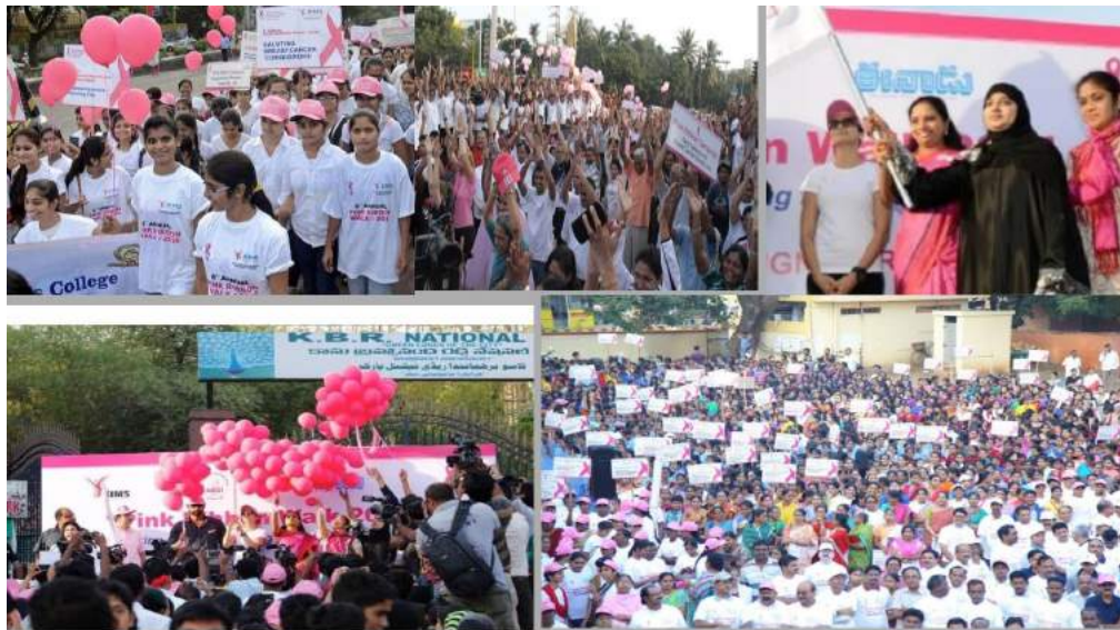
Glimpses from Pink Ribbon Walks held in Hyderabad, Warangal, Vijayawada and Visakhapatnam in October (International Breast cancer awareness month) – major cities and towns in Telangana and Andhra Pradesh (2008 - 2019)

After the Foundation introduced the innovative Pink Ribbon Walk in 2008, it is very gratifying that many NGOs and Hospitals in the region have embarked upon conducting similar programmes not only for breast cancer awareness, but for other illnesses as well, which also desperately need urgent attention. This speaks volumes of the “Pink Ribbon Campaign” that has enthused individuals, Organisations and Institutions to take up & spearhead impactful awareness activities.