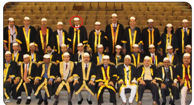
ASI Governing Council Meeting, Independence Day Chennai

Through an online e-polling held all over India, elected to serve on the National Governing Council (2013 – 2015) of the Association of Surgeons of India – the largest Organisation in the Indian Subcontinent that represents some 15, 000 surgeons all over India.