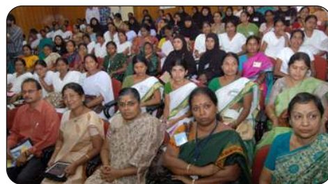
Health Care workers along with Trainers at the launch of the Screening Programme

In partnership with the Govt of Andhra Pradesh, Ushalakshmi Breast Cancer Foundation (UBF) has initiated a simple & inexpensive community based Breast Cancer Screening Programme in Andhra Pradesh aimed at early detection of breast cancer, which hopefully would translate into saving more lives. UBF has trained some 900 Community based Health Care Workers through established & well researched audio visual aids about importance of breast awareness & early signs of breast cancer. These healthcare workers have thus far screened 28,437 underprivileged women in Hyderabad District. Free treatment was provided to women diagnosed with Breast Cancer through the Rajiv Arogyasree Scheme.